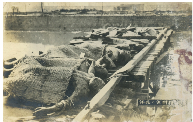
Figure 2: Example of a postcard showing the dead sold illegally after the quake. Please click