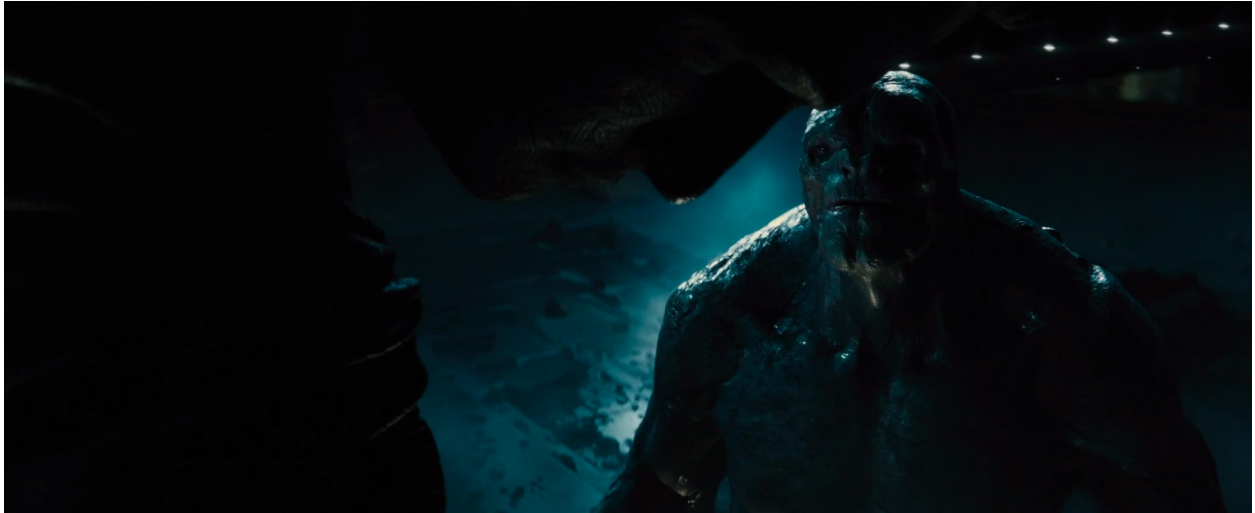
Fig.7 | Batman v Superman: Dawn of Justice . Doomsday defacing the symmetry of Superman.