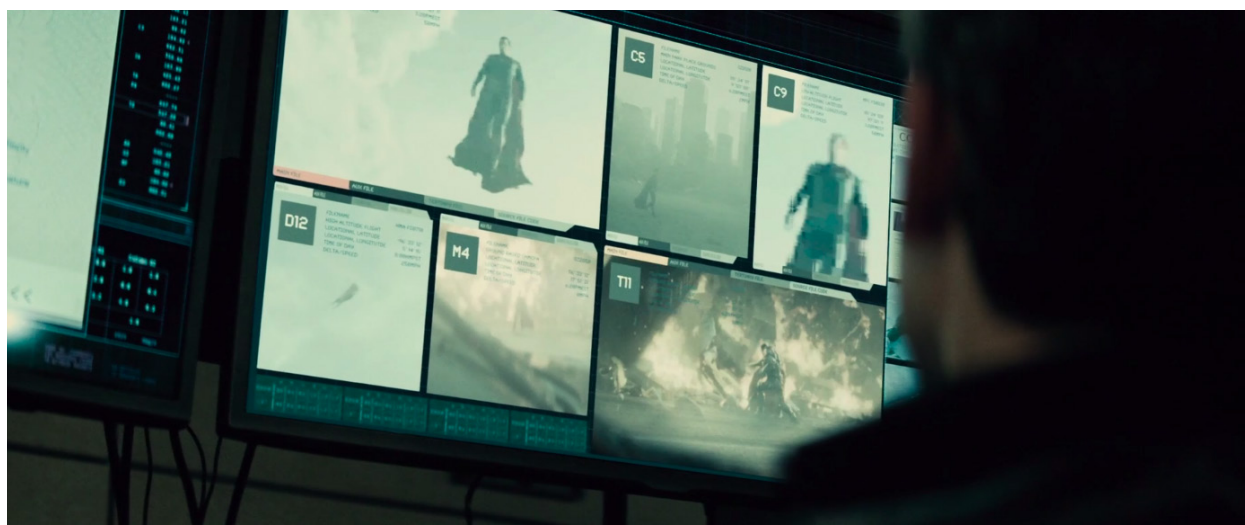
Fig. 5 | Batman v Superman: Dawn of Justice . The public guilt of Superman contrasted with the private guilt of Bruce Wayne.