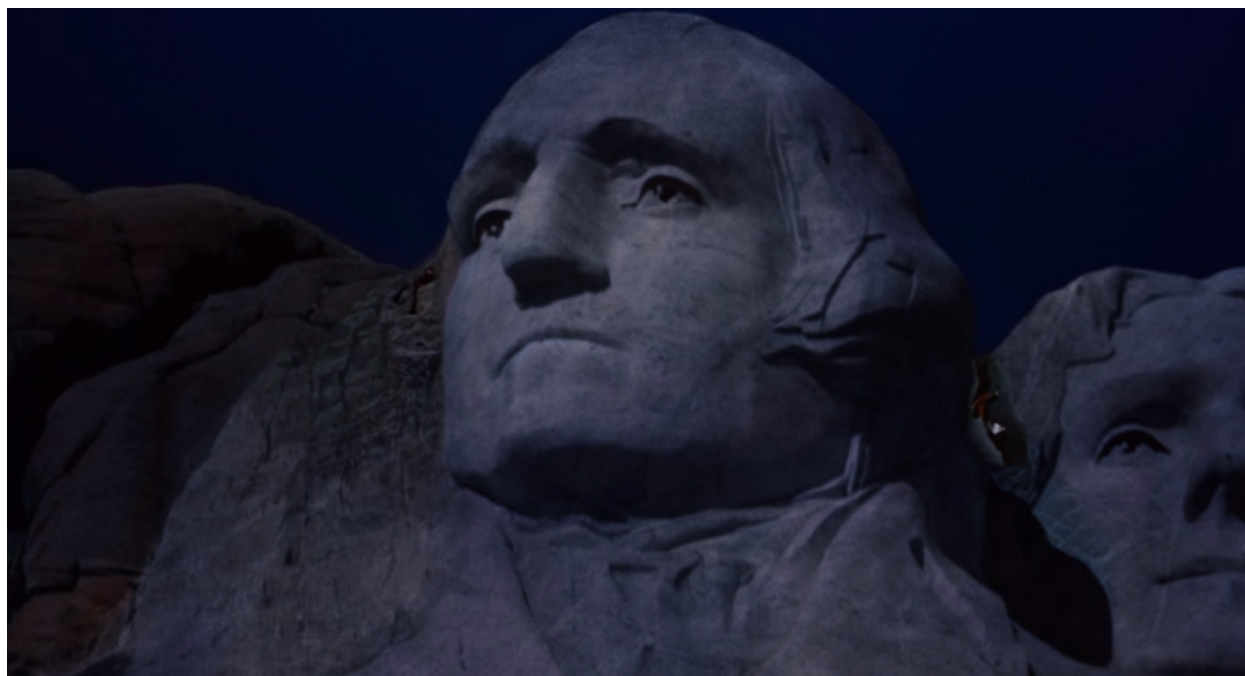
Fig. 2 | The Cold War defacing the symmetry of Mount Rushmore in North by Northwest .

from both Vandamm and the authorities. The film experiences its chaotic society with a repetition of stark crisscrossing lines, from the opening titles, to Route 41, to Thornhill scaling the beams of Vandamm's house, to the subtle defacing of the steady symmetry of Mount Rushmore (Fig. 2). The visuals are underscored by "the restlessly chromatic and fragmented nature" of the music, creating "an imbalance that is subconsciously felt by the viewer" (referenced by Daniel-Richard 55 from Brown 29). While the audience never learns the full truth about this chaos—"FBI, CIA, ONI, we're all in the same alphabet soup," one agent says—Thornhill and his ally, Eve Kendall (Eva Marie Saint), inspire a break in the pattern. When the heroes are saved by the open intervention of American authorities, Vandamm replies, "[t]hat wasn't very sporting, using real bullets."