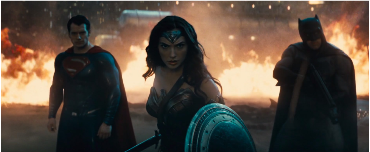
Fig.8 | Batman v Superman: Dawn of Justice . A unity externalized.

stakes of Doomsday lie not in desensitized destruction, but in emotion, and societal symmetry is sullied not as a thriller on Mount Rushmore, but with superhero mayhem (Fig. 7). Doomsday overtakes Luthor, the media, the military, and the government, which reacts with systematic disposal by nuclear weapons while knowing that its citizen, Superman, would be a casualty. But violence only makes Doomsday stronger, and reflects back from a red glow within.