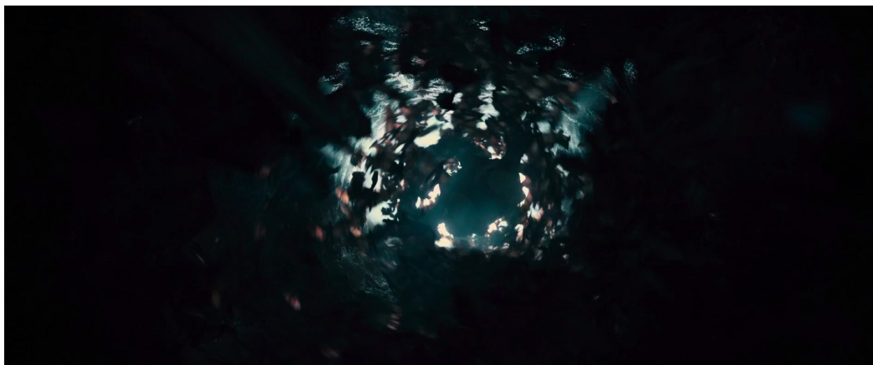
Fig.4 | Batman v Superman: Dawn of Justice . Scottie falls down, Bruce falls up.

Like the dichotomy that Deflem identified in Hitchcock's work, Luthor's plot juxtaposes the personal guilt of these heroes with the public guilt of the media-saturated dimensions of contemporary society. Deflem writes that Hitchcockian "labeling of guilt... includes various public instruments and symbols of condemnation," and identifies "[t]wo cinematic types of Hitchcockian affliction" as "the wrong man and the chase" (215), such as Cary Grant's on-the-run protagonists in To Catch a Thief and North by Northwest . Batman v Superman cinematically chases its protagonists across media. When Alfred announces to Bruce how "[e]verything's changed," he contrasts a series of