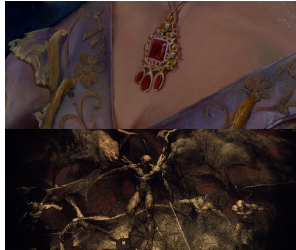
Fig.9 | Vertigo ; Batman v Superman: Dawn of Justice .

While Bruce realizes that the Flash was not talking about Superman in his dream, Luthor's painting is reintroduced, this time with its demons turned toward the sky, and juxtaposed with a tease of a future threat: "[o]ut in the dark, among the stars." Like