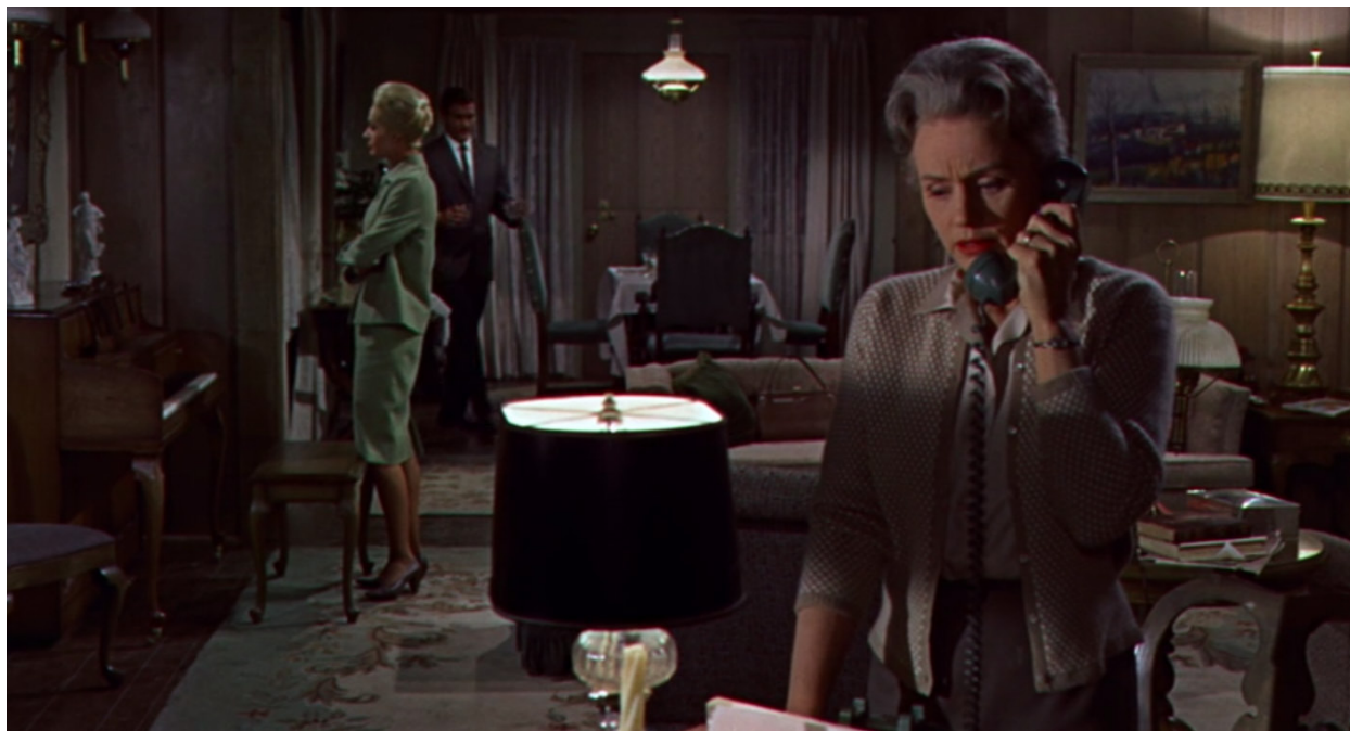
Fig.1 | Juxtaposition of tensions brings avian aggressors out of the woodwork in The Birds .